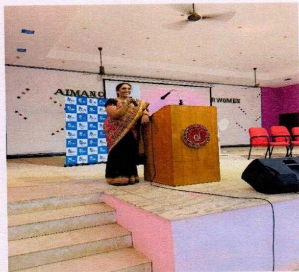
The Guest speaker presented her slides on the topic polycystic ovarian syndrome to the students