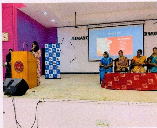
Student of Nutrition and Dietetics Department proposed the vote of Thanks