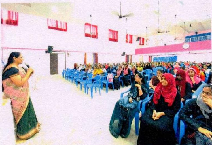
All UG final year Students actively participated in the event